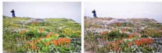
High color light output